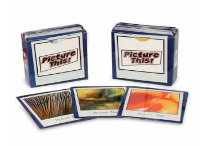
Figure 3. Picture This! Card Game

Each group receives several cards and is allocated three minutes to discuss and try identify their images. They are then subsequently probed by me for their own interpretations of these pictures, and provide an explanation for their answers. I explain that their responses are all valid because it highlights their cognitive process, before revealing the correct answer. The purpose of this particular task is to emphasise that research topics are cross disciplinary by nature and the importance of viewing them holistically rather than analytically. While reiterating the message that research must be made interesting to the reader by viewing a subject from a different perspective. The impact of these games on students' cognitive and meta-cognitive abilities is evident in the transformative learning which occurs in the days proceeding the session. In subsequent individual consultations with me to discuss their research, several students mentioned how these games provided greater clarity to the entire process. They felt confident to adopt a more innovative approach to refining their own topic from a fresh perspective. As previously discussed these newly acquired transferable skills align both with institutional objectives and will benefit them in a future work environment.